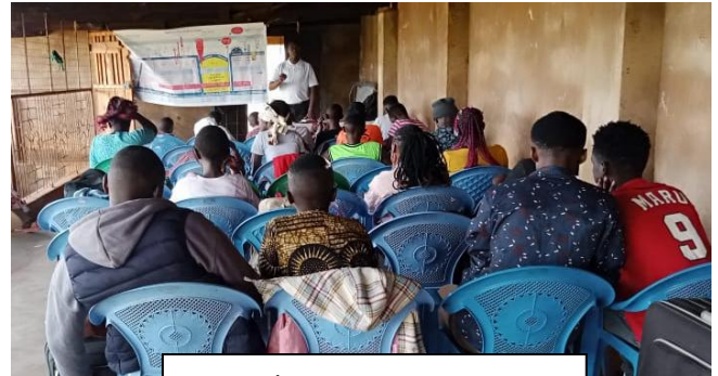
Youth Ministry Itugururu